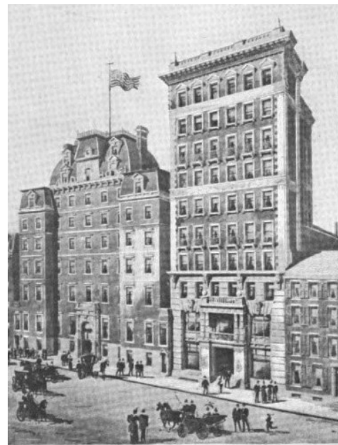
THE ALDINE HOTEL.

The Aldine Trust Company itself was later absorbed by the Commonwealth of Pennsylvania. The building continued to house professional offices before being converted to apartments in 2003. Today, in addition to The Republic Apartments, it is home to Jane G's Dim Sum House.