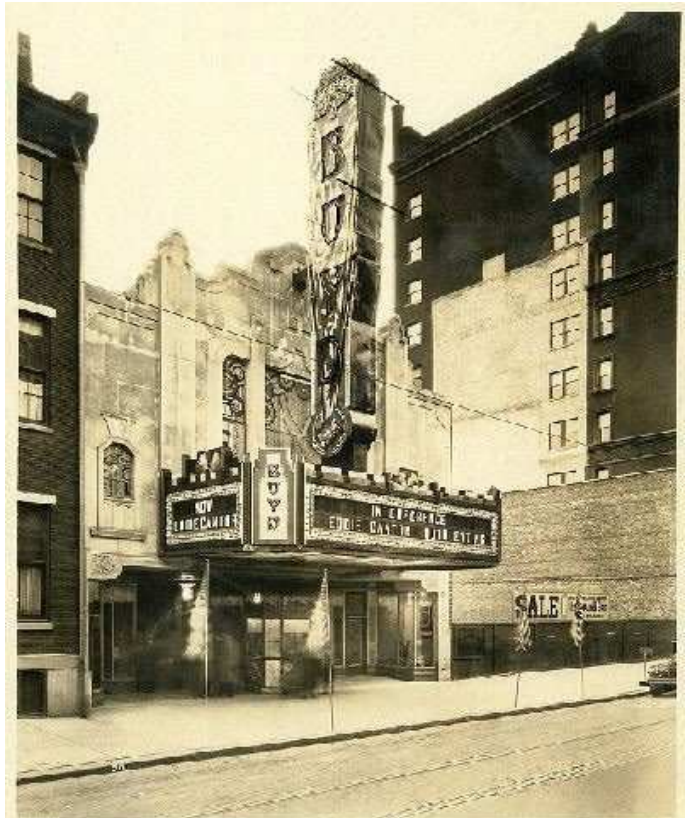
The Boyd Theatre, 1908-1910 Chestnut St., opened on Christmas day 1928 with the feature film Interference, starring Eddie Cantor.